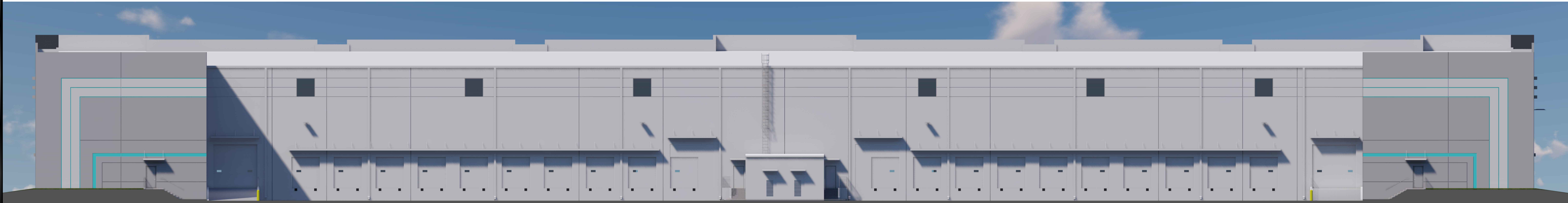
2 WEST ELEVATION N.T.S.